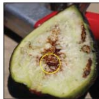
Figure 4. BFF pupa found inside of a fig.

Monitoring: Fig fruits can be inspected for signs of BFF activity, such as larval feeding or exit holes. Focus on unripe fruits that have recently fallen from the tree. Populations of BFF adults can also be monitored using McPhail-type traps (Figure 5) baited with torula yeast lures, although the efficacy of this trap/lure combination is still under evaluation.