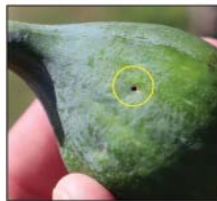
Figure 3. Exit hole from larva burrowing out of the fruit.