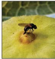
Figure 1. BFF female depositing eggs into the fig ostiole.

Overview: Fig growers need to be aware of the black fig fly (BFF), an invasive insect that was recently discovered infesting figs in multiple counties in southern California. The BFF has been reported in the following counties: Los Angeles, Orange, Riverside, Santa Barbara, San Bernardino, San Diego and Ventura. Movement of figs from these counties is not recommended, as it may lead to additional artificial spread of BFF to other areas of the state. University of California Cooperative Extension personnel are currently working with the California Department of Food and Agriculture to further delineate populations, as well as develop improved monitoring and management strategies.