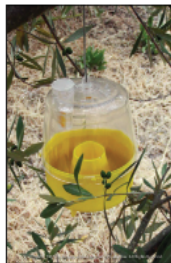
Figure 5. McPhail-type trap.

Management: Biological control appears to be limited and there are currently no chemical controls registered specifically for this pest on California figs. As such, orchard sanitation is critical, and growers should make sure to remove and destroy any BFF-infested fruits. Larvae in infested fruit are protected from pesticide sprays and there are no effective soil drenches for pupal control. Insecticidal baits (e.g. GF-120 NF Naturalyte®) may be useful for control of adult BFF but note that label rates have not been directly tested for efficacy against this pest. Consult with a licensed pest control adviser and your County Agricultural Commissioner before applying any chemical controls.