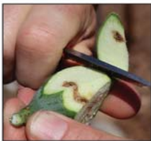
Figure 2. Internal damage to the fig from larval feeding.

Life Cycle: The BFF only attacks figs and prefers unripe and unfertilized fruits. The adult female deposits eggs into the fruit through the ostiole (Figure 1) and larvae subsequently feed internally on the fruit (Figure 2). This feeding damages the fruit and causes it to prematurely drop from the tree. Upon completion of development, the BFF larvae make their way out of the fruit (Figure 3), drop to the soil and pupate. In some cases, BFF pupae have been recovered inside of fruits as well (Figure 4). Black fig flies overwinter as pupae in the soil. In the spring they emerge, mate and begin to attack figs. The BFF can have between 4 to 6 generations per year (more in warmer areas, fewer in cooler areas).