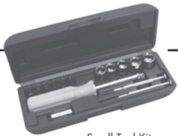
Small Tool Kit - approx. size 7" x 2-1/2"

Please send me more information on Nationwide Health Plans, and a FREE gift.